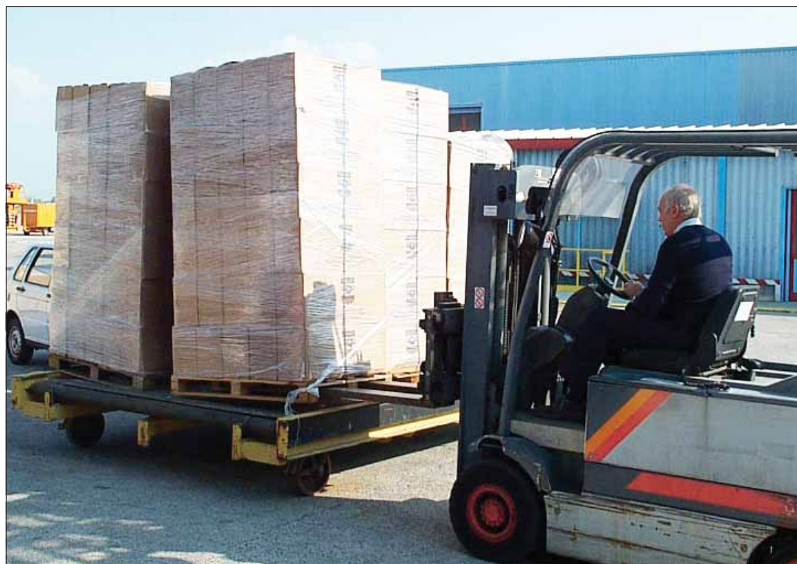
USAID humanitarian supplies heading to the Philippines to provide aid for those effected by Typhoon Fengshen is moved to be loaded onto an airplane at the Pisa Airport. Part of 3rd Battalion, 405th Army Field Support Brigade's mission is to pack the supplies for transportation. The unit is located on Camp Darby.

According to USAID, the value of the commodities sent to the Filipino people originating at the 3/405th AFSB was more than $550,000, including transportation.