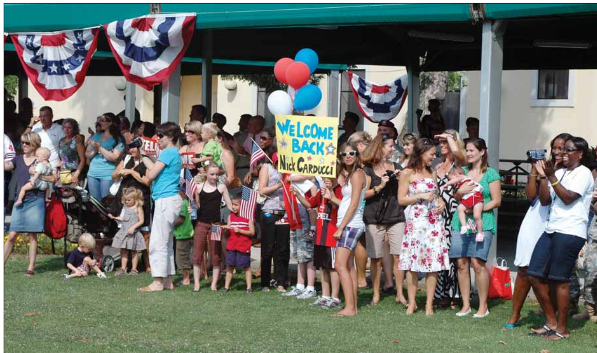
Above: Family members and friends prepare to welcome home the Soldiers of the 173rd Airborne Brigade Combat Team on Tuesday's homecoming.