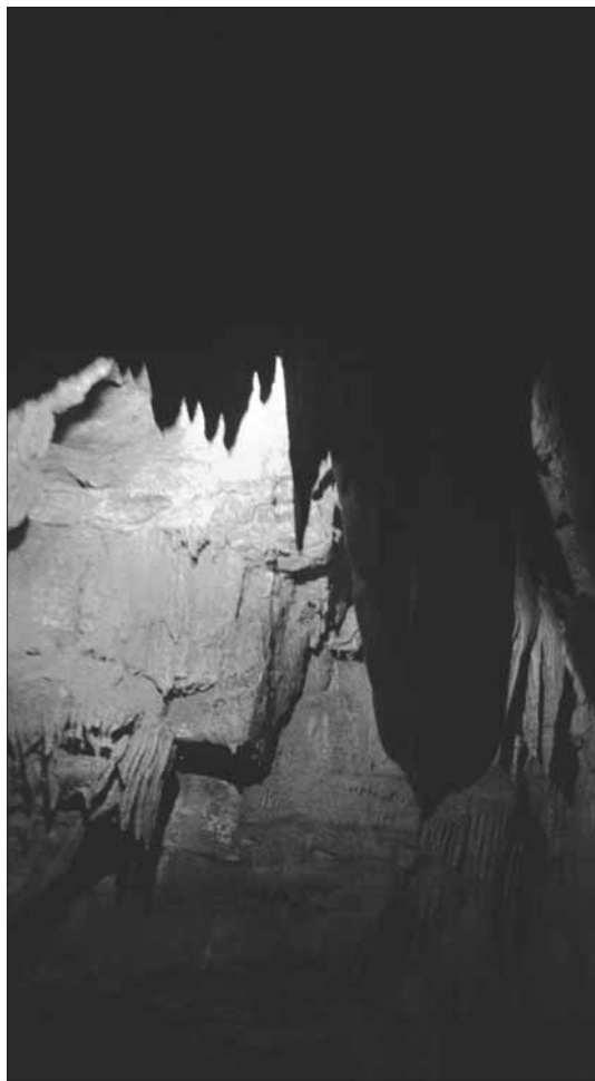
The main room of the Colata , where the biggest stalactites are about 14 meters long.

Right: Visitors stroll through the park area.