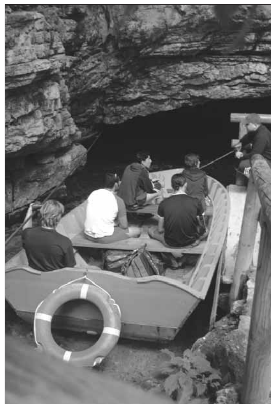
Some visitors sit in one of the small boats used for the tour. Guides lead the boat into the Parolini Cave by pulling a rope. The cave takes its name from the botanist Alberto Parolini who discovered the cave in 1822.

No matter how warm it is outside, bring a jacket because the temperature is steady at about 12 degrees Celsius, about 54 degrees Fahrenheit, all year long. In fact, the massive rocks that surround the visiting area prevent any temperature change inside. The water