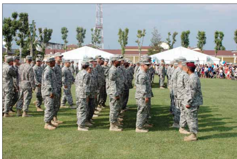
Left: Soldiers wait patiently in formation for the redeployment ceremony celebrating Tuesday's homecoming of deployed units. Units of the 173rd ABCT are returning to homestations in Italy and Germany following a 15-month deployment to Afghanistan.